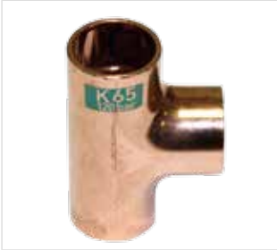
K65 Tee (reduced)