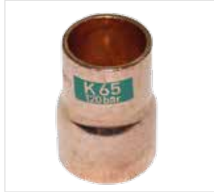
K65 Reduced coupler