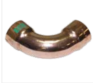
K65 Elbow 90°