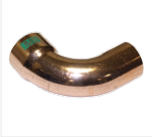
K65 Street Elbow 90° IA