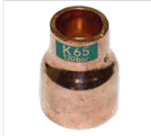
K65 Fitting Reducer