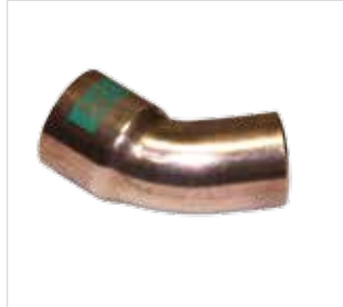
K65 Street Elbow 45° IA