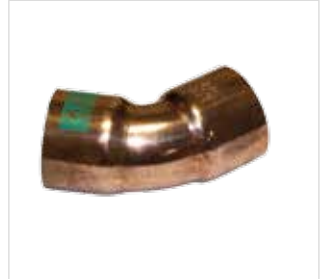
K65 Elbow 45°